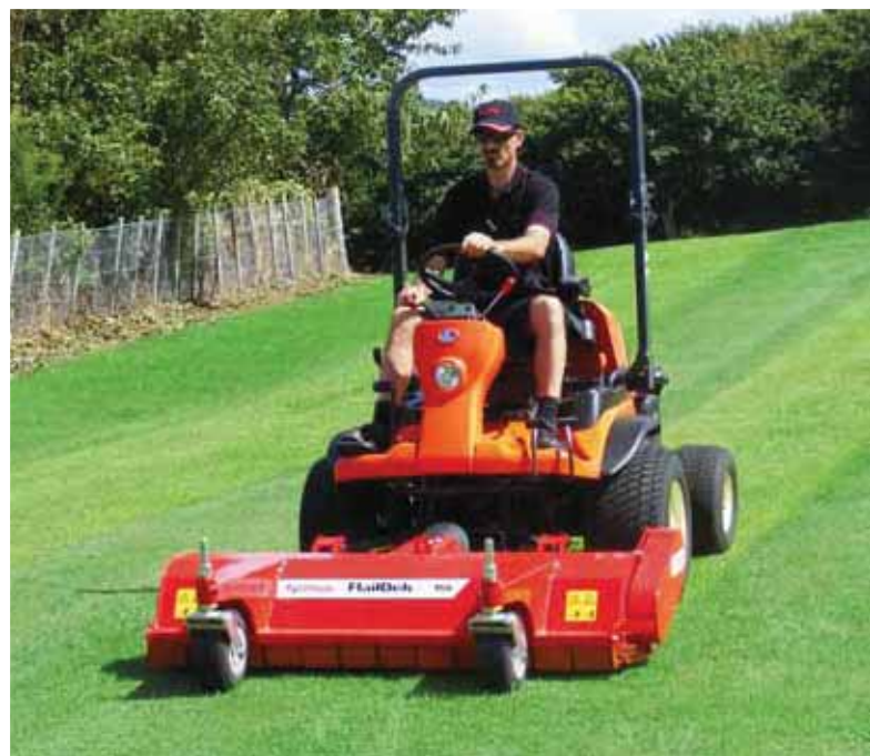
The FlailDekFX produces a brilliant striping effect

The full width rear roller prevents unsightly scalping and permits the edge of the mower to be run along kerbs and banks without fear of blade strike. The roller also adds to overall safety and produces a brilliant striping effect for those wishing to pattern their turf.