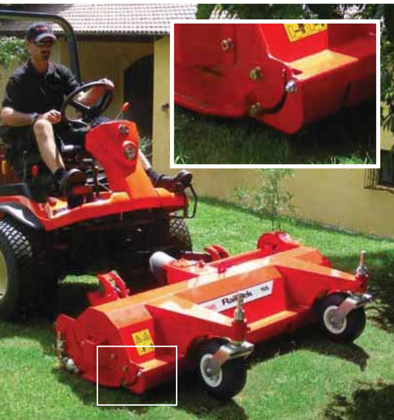
For short grass cutting the Converter is set in the closed position

The Trimax FlailDekFX is engineered for long life. The body, made from high tensile steel, features monocoque construction and has been developed in conjunction with a rigorous destructive testing programme. The rotor is dynamically balanced at the factory and rugged castor mountings are an integral part of the body. Ease of maintenance is also one of Trimax's key design parameters. The drive belts can be tensioned and the bearings greased without removing the transmission cover. For hassle free operation the cut height can be quickly altered using the positive height adjusters. Trimax's attention to detail results in a mower that will provide you with years of reliable service in a wide spectrum of applications.