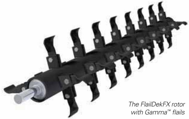
The FlailDekFX rotor with Gamma™ flails

The Trimax FlailDekFX offers a high performance alternative to the standard factory-fitted rotary mowing attachments found on John Deere, Kubota, Iseki, New Holland, Shibaura and Hustler out-front tractors. The ability to deliver an exceptionally clean cut and disperse clippings evenly without clumping means the FlailDekFX is suitable for sports grounds, roadsides, schools, parks and other fine turf applications.