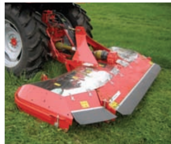
Handles infrequently mown long grass with ease.