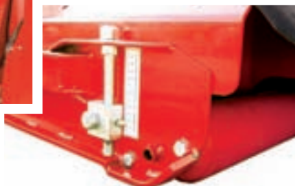
Infinitely variable height adjustment.