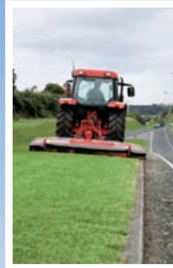
Rollers allow mowing along edges.

With downwing flotation, simple and infinitely variable height adjustment, full width striping, innovative new maintenance features and LazerBladez™, the StealthS2 will continue to set the standard for many years to come.