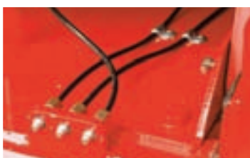
Centralised grease points for ease of maintenance.

Complicated height adjustment is a thing of the past with StealthS2's simple and infinitely variable system. Height adjustment is now fast and easy.