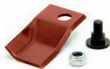
LazerBladez™ fling-tip blade, blade bolt and self-locking nut.

Maintenance with StealthS2 is a breeze due to its innovative details. All grease points are accessible with the mower wings up and automatic belt tensioners are standard. The custom roller bearing greasing system also increases bearing life. This adds up to less maintenance and greater productivity.