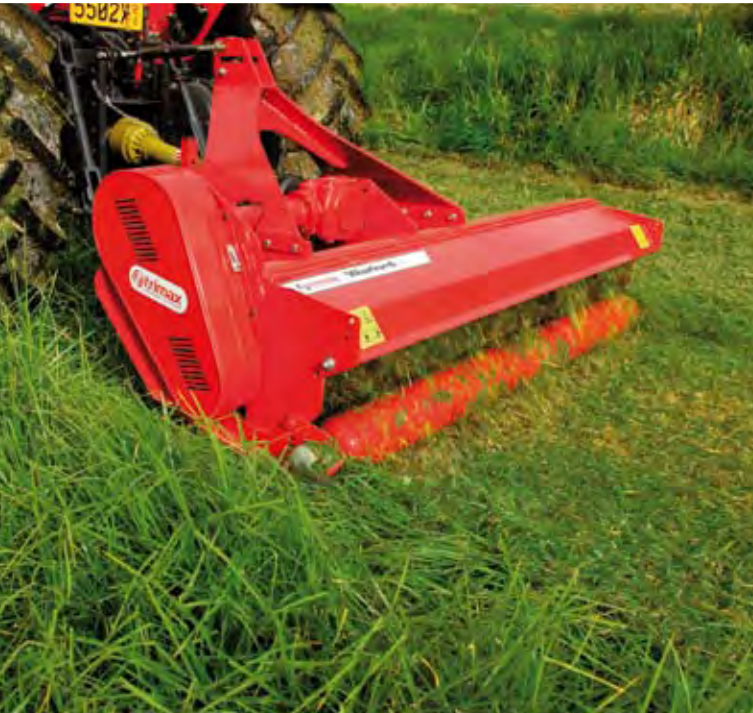
The WarlordS2 excels in long grass.

The large diameter full width rear roller allows the mower to be run along kerbs and banks without scalping or blade strike. Domed ends minimise scuffing on turns and cutting height can be altered by adjusting the rear roller.