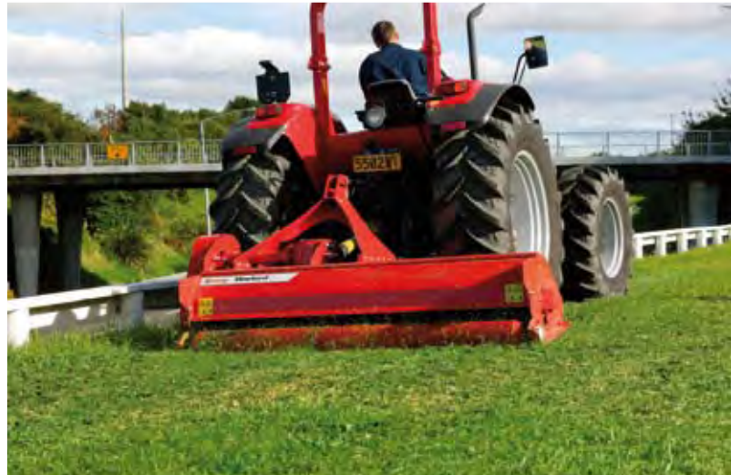
Your ideal roadside mowing partner.